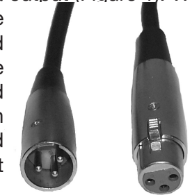
Figure 1 Elation Professional - www.elationlighting.com - ELED Fresnel 100WW User Manual Page 5

recommend Accu-Cable DMX cables. If you are making your own cables, be sure to use standard 110-120 Ohm shielded cable (This cable may be purchased at almost all professional sound and lighting stores). Your cables should be made with a male and female XLR connector on either end of the cable. Also remember that DMX cable must be daisy chained and cannot be split.