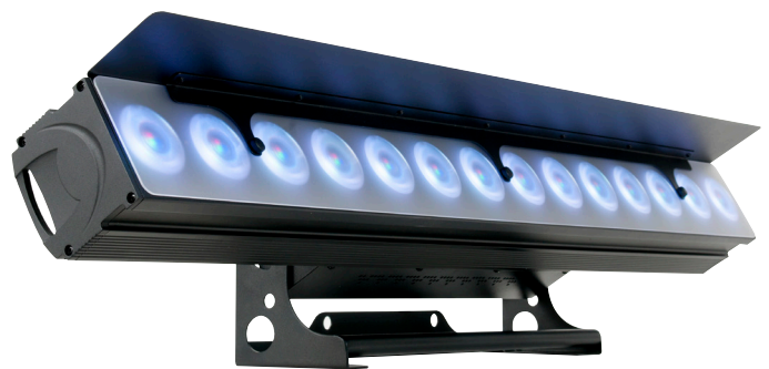
Glare Shield + Frost Filter Installed