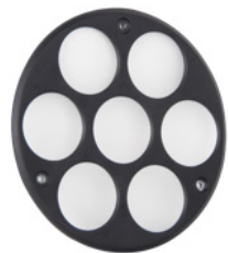
RAY047-GFH DIFFUSION HOLDER FOR RAYZOR Q7