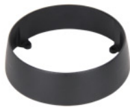
RAY047-SNOOT SNOOT FOR RAYZOR Q7